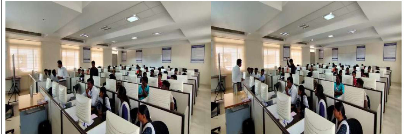
Guest lecture for Computer Networks