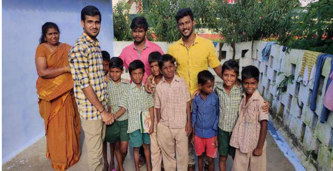
Anbu Trust, pallipalayam

Deya is a society started by our computer science and engineering department students. The main objective of this organization is to extend our helping hands to all the needy ones and therefore being the citizens of nation we have incepted this work with the poor children by helping those nonprofit trusts caring for the orphans by providing a support to their work.