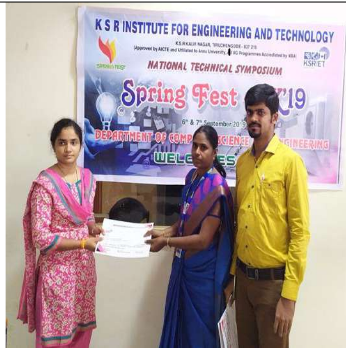
Prize distribution for event winners