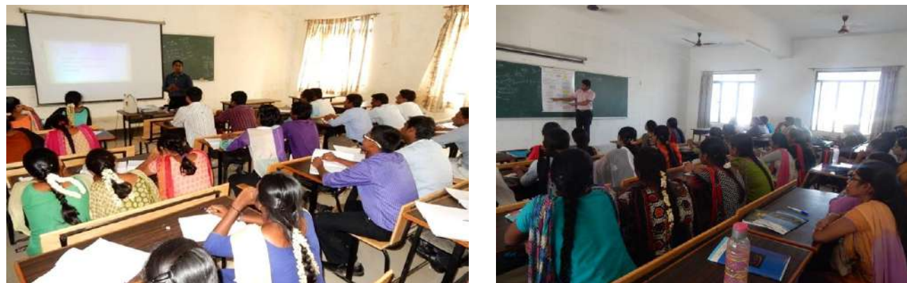
Data Analytics using Python and R Programming