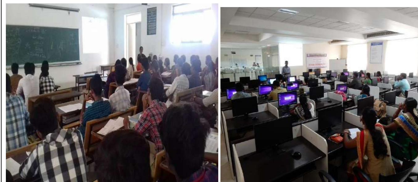
Guest lecture for HWM