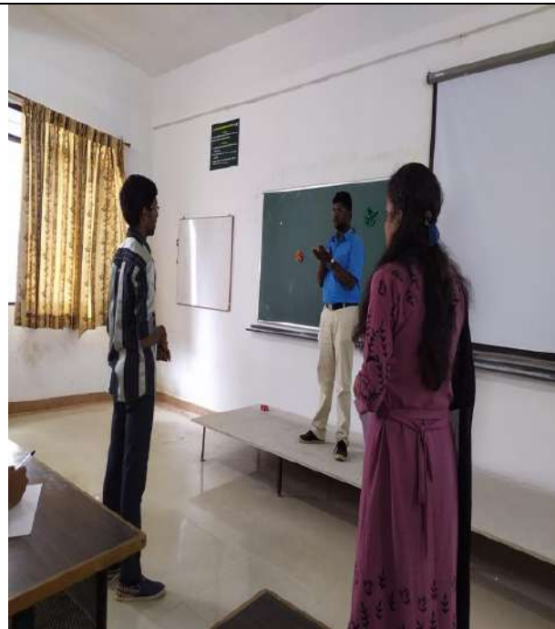
Hear and Act