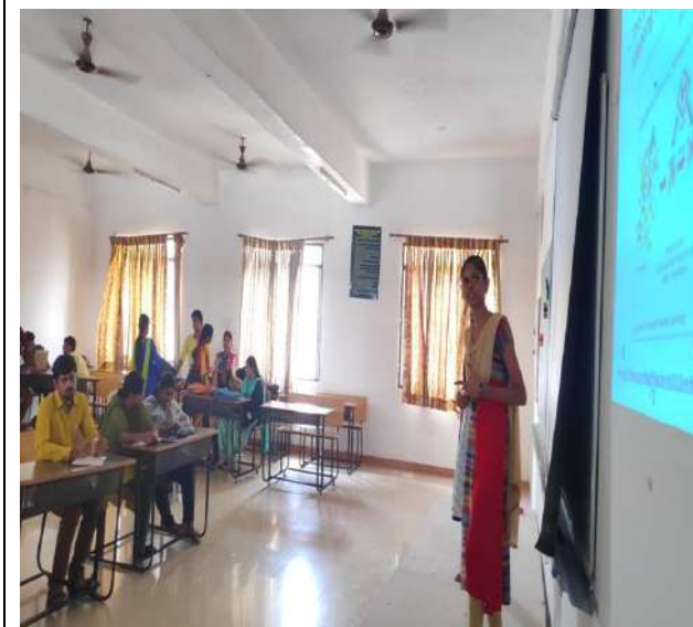
06.09.2019 Paper Presentation

SpringFest'19 offers a platform for the students to meet, exchange ideas and interact with experts to enrich their talent, creativity and prove their intellect. It is sure that the participants will return immensely enriched and more confident. The students of Computer Science and Engineering are organizing events like paper presentation, technical and non-technical events. Technical events like Kodd Corner and Tech puzzle. Non-technical events like Hear & Act, Logo Quiz and Short film. These events could make the students to build upon a perfect and confident entrepreneur and engineer.